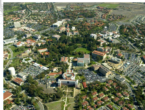
Aerial view of UC Irvine