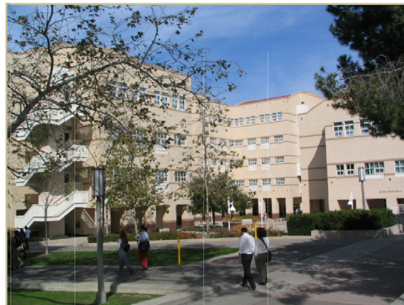
Social Science Plaza

On behalf of the faculty and staff in the School of Social Sciences, I would like to congratulate you on your acceptance to UCI and the School of Social Sciences. I am pleased to greet you as you move toward your baccalaureate degree at UCI. An important part of your academic success is the careful selection of courses appropriate to your educational background and goals.