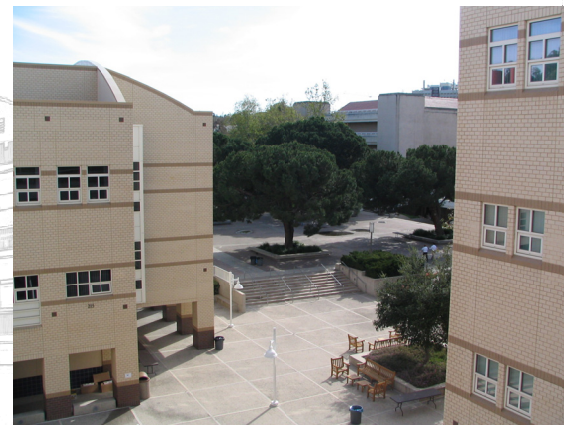
Social Science Plaza