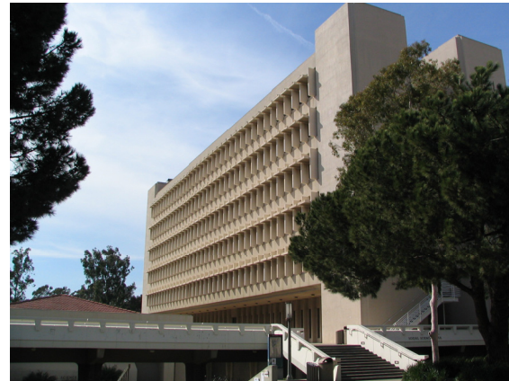
Social Science Tower